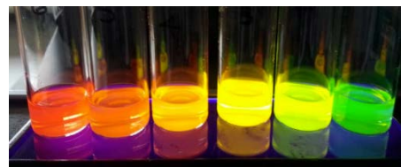
Figure 2 Quantum Dot Fluorescence