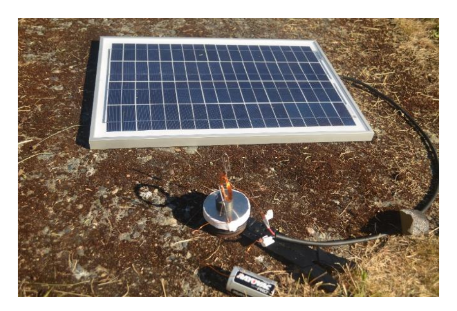
Pictured are the solar panel and completed DC motor