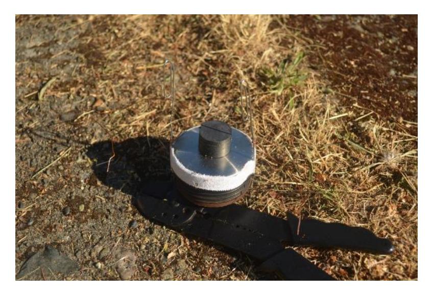
Neodymium magnet placed on the base of the motor.

10. Connect the other ends of the wires to the solar panel leads.