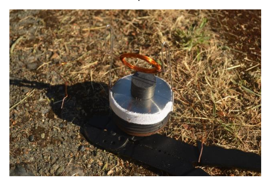
Completed motor showing the magnet coil placed just above the neodymium magnet.

10. Connect the other ends of the wires to the solar panel leads.