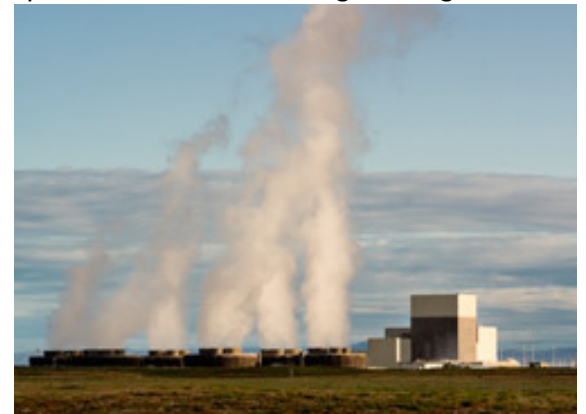
Columbia Generating Station, Richland, WA https://www.nrc.gov/info-finder/reactors/wash2.html.png

The first place where the voltage is lowered is at a power substation. Here the voltage is lowered and then distributed in different directions to take power to different neighborhoods. Sending the power out in multiple directions prevents entire communities from losing power if the company needs to repair one line. Instead, a small area of the community will be out of power during the repair.